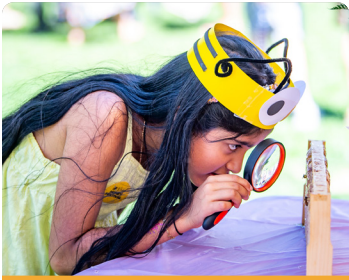
Honey Festival