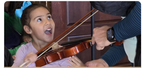
Girl & violin

Enriches Parker's cultural landscape with exceptional live music.