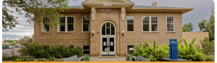
The Schoolhouse