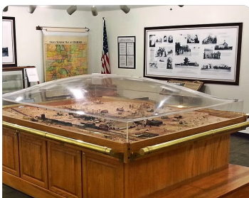
Early 1900's Parker diorama

Essential for cultivating a vibrant, inclusive cultural landscape.