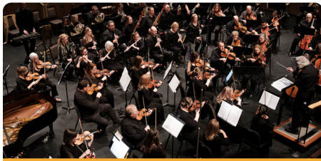
PSO

Parker Arts offers several recurring performance series that deepen the creative life of our community and provide consistent engagement throughout the year.