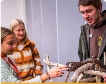
Science Night

Supports local businesses while strengthening community tradition and environmental awareness.