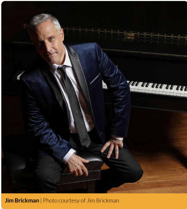
Jim Brickman

National Touring Series performances attract audiences from all around the metro area and surrounding rural communities, offering sponsors not only visibility in front of packed houses but also the unique opportunity to meet some incredibly talented musicians!