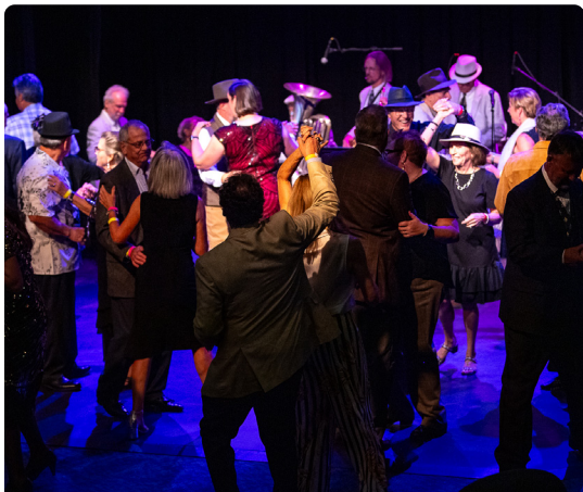
Route 66

Each year, these events welcome more than 16,000+ attendees of all ages and backgrounds.