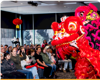
Lunar New Year

Sparks curiosity and hands-on learning in youth and families.