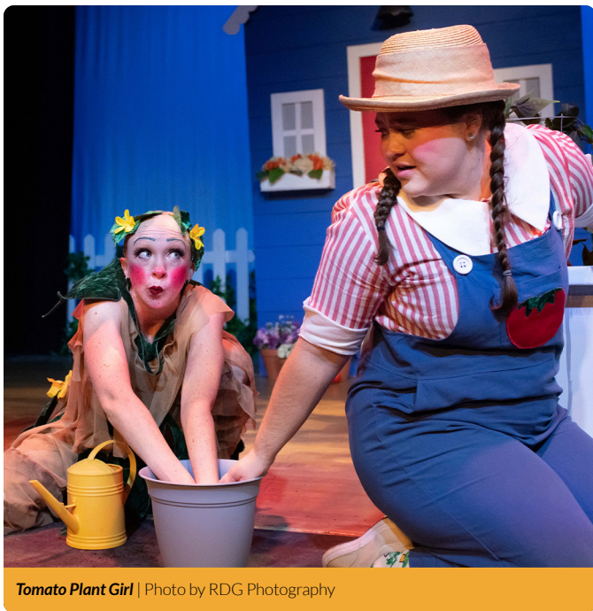
Tomato Plant Girl

These programs are designed to complement classroom learning and provide accessible cultural enrichment opportunities for students across public and private schools, preschools, homeschools, and organizations serving students with disabilities.