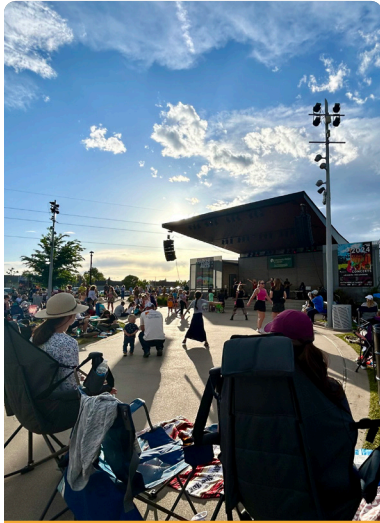
Discovery Park

Sponsors who support free programming are recognized as champions of access, inclusion, and community connection.