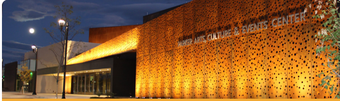
PACE Center

The programs throughout this guide – free events, youth education, signature performances – are only possible because Parker has dedicated cultural spaces. Season and facility partners provide foundational support that sustains Parker Arts year-round. These are our most comprehensive and visible partnership opportunities.