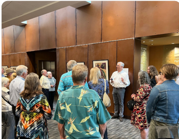
Modernist West Art Reception

Sponsoring art exhibits, receptions, and heritage centers strengthens communities by supporting artists, fostering connection, and preserving cultural identity. These investments create meaningful experiences, expand access to the arts, and ensure creative and historical legacies to continue.