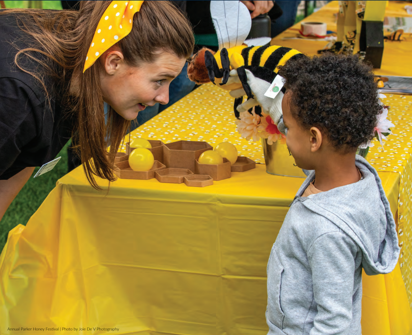
Annual Parker Honey Festival