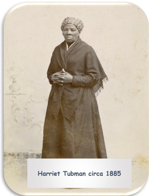
Harriet Tubman circa 1885

In 1849, Tubman escaped from slavery, and fled to Philadelphia. She then immediately returned to Maryland to rescue her family. Slowly, one group at a time, she brought relatives with her out of the state, and eventually guided dozens of other slaves to freedom. Traveling by night and in extreme secrecy, Tubman (or "Moses", as she was called) "never lost a passenger" After the Fugitive Slave Act of 1850 was passed, she helped guide fugitives farther north into British North America and helped newly freed slaves find work.